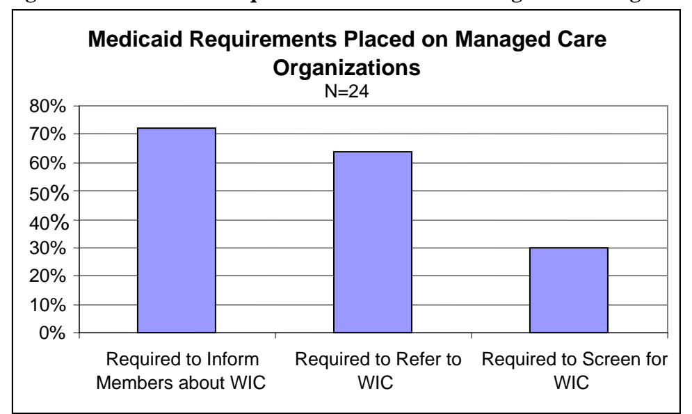
Figure 3-B. Medicaid Requirements Placed on Managed Care Organizations

Interestingly, however, only 30 percent of Medicaid agencies required their MCOs to screen for WIC. Louisiana is one such example that does require MCOs screening by requiring that the information on the WIC Participant Identification Folder be included in the MCO enrollment form to ensure that clients are enrolled in or are referred to WIC.