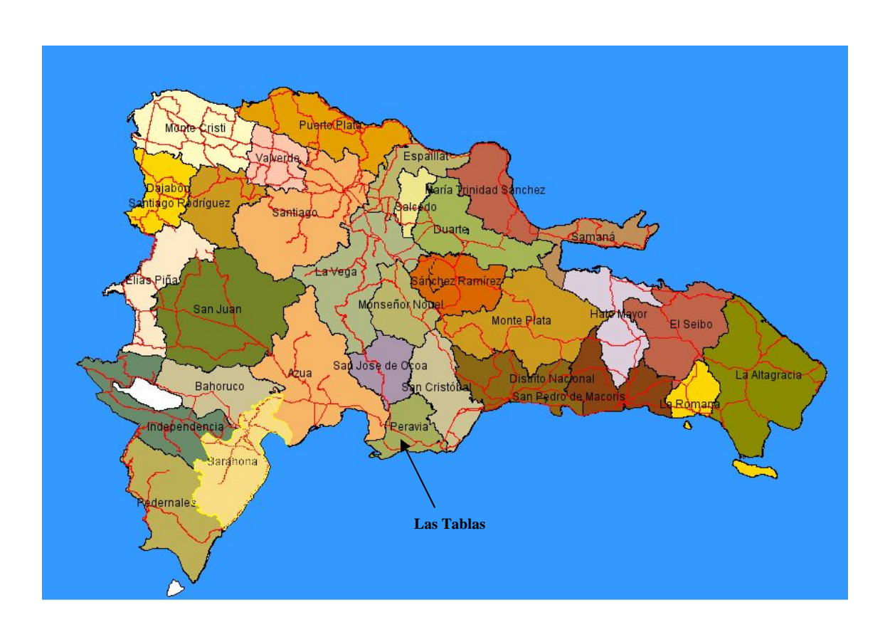
Figure 1. Map of Dominican Republic. The Food Security Pilot Survey was conducted in Las Tablas.

study focused on populations that are prone to frequent and severe food insecurity, we used a 30 day reference period and modified questions in the module accordingly. This included changing questions 8a, 12a and 14a, which ask how often conditions occurred, to accommodate the 30 day reference period. We also omitted the first level-preliminary screener questions since a large majority of the target population was expected to be food-insecure.