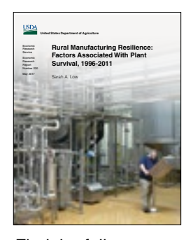
Find the full report at www.ers.usda.gov/ publications