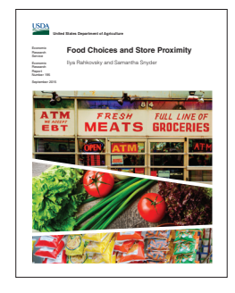
Find the full report at www.ers.usda.gov/ publications/erreconomic-researchreport/err195