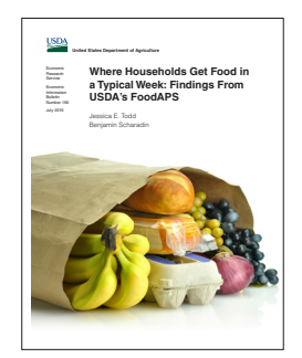
Find the full report at www.ers.usda.gov/ publications/eib-economic-informationbulletin/eib156