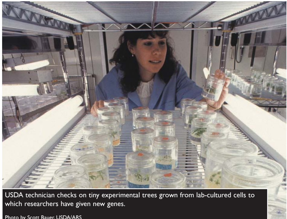
USDA technician checks on tiny experimental trees grown from lab-cultured cells to which researchers have given new genes.

Ag biotech patents, mostly dealing with some aspect of plant breeding, have outpaced the general upward trend in patenting throughout the U.S. economy. During the 1996-2000 period, 75 percent of over 4,200 new ag biotech patents went to private industry (see "Ag Biotech Patents: Who's Doing What?" in Amber Waves , November 2003).