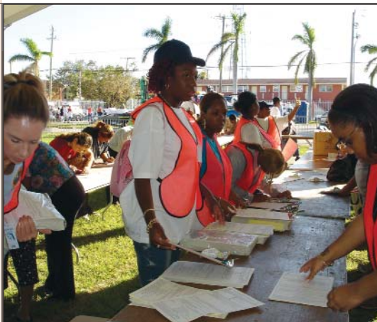
FNS Southeast Regional Office