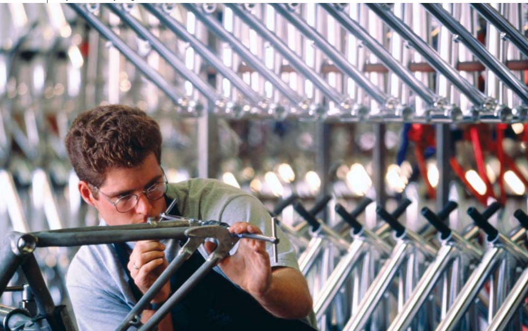
Andy Sacks, GettyImages

While rural creative-class counties may grow because of the presence of the cre-