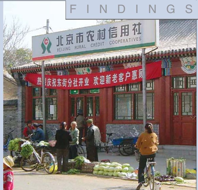
Fred Gale, USDA/ERS

Some of the loans finance agribusiness firms, rural roads, water projects, and other infrastructure. Most of the loans, however, are small short-term loans of less than $1,000 made to agricultural households by rural credit cooperatives, the primary financial institutions serving rural communities. While the loans are labeled "agricultural,"