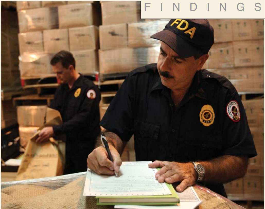
U.S. Food and Drug Administration

Of the 70,369 import violations in 1998-2004, 65 percent were for adulteration, 33 percent were for misbranding, and 2 percent were for "other violations," such as items forbidden or restricted in sale. Adulteration involves product safety, package integrity, or sanitation.